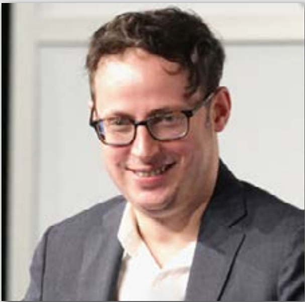
Nate Silver, founder & editor of FiveThirtyEight.com

Noted statistician Nate Silver, who analyzes political elections for a living, sees two Republican incumbents in the Valley's congressional delegation losing their seats in the November election. Neither of them is Rep. Devin Nunes of Tulare.