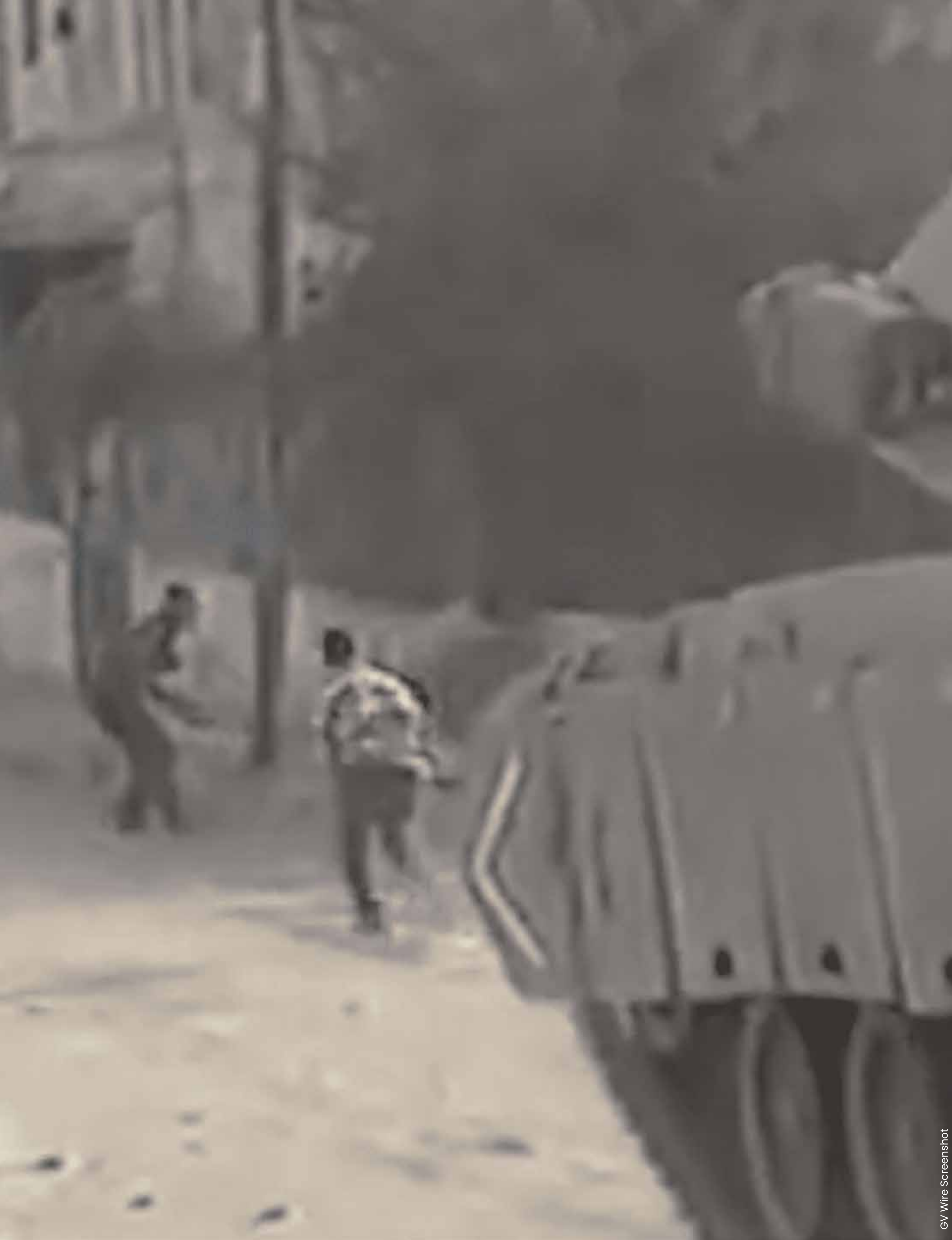
GV Wire Screenshot