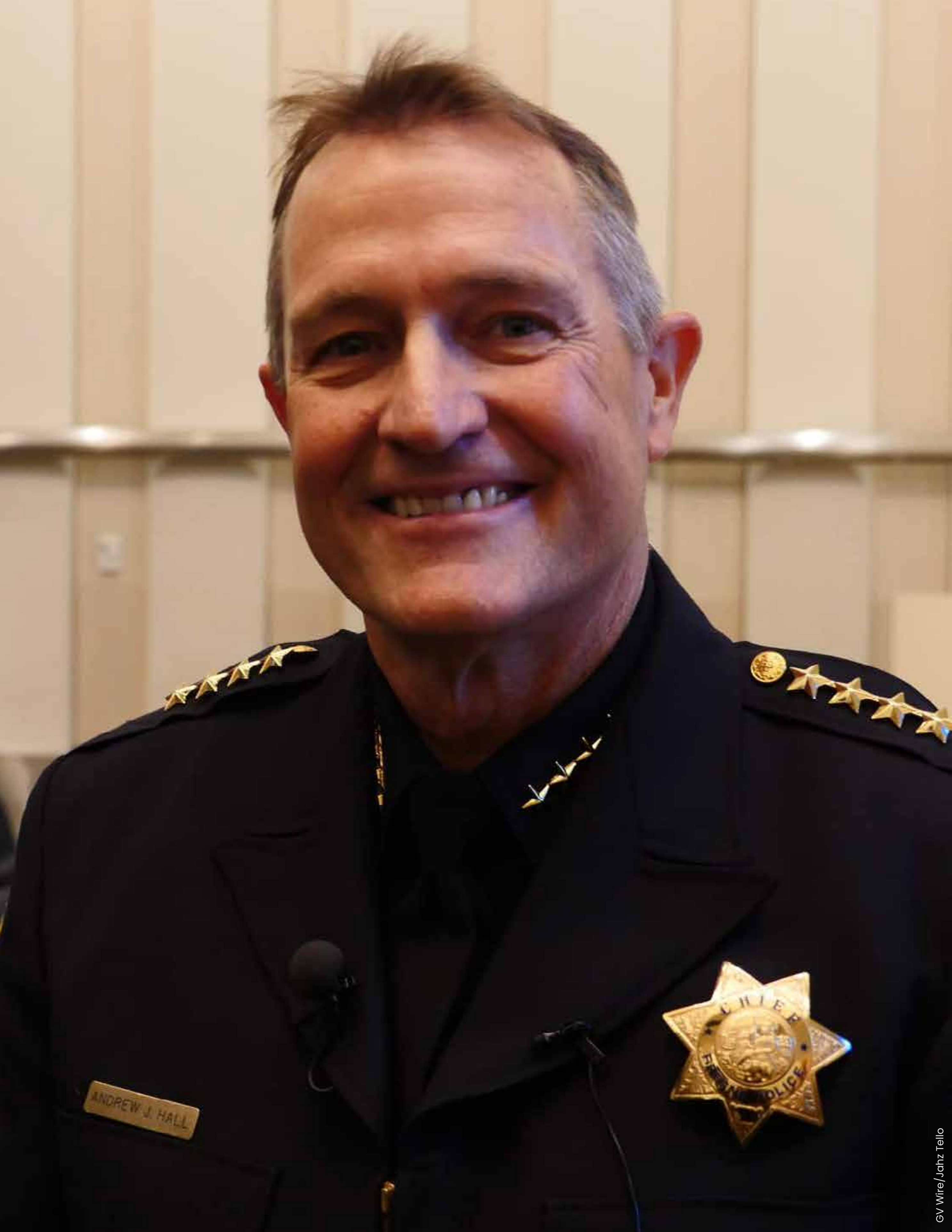
GV Wire/Jahz Tejo