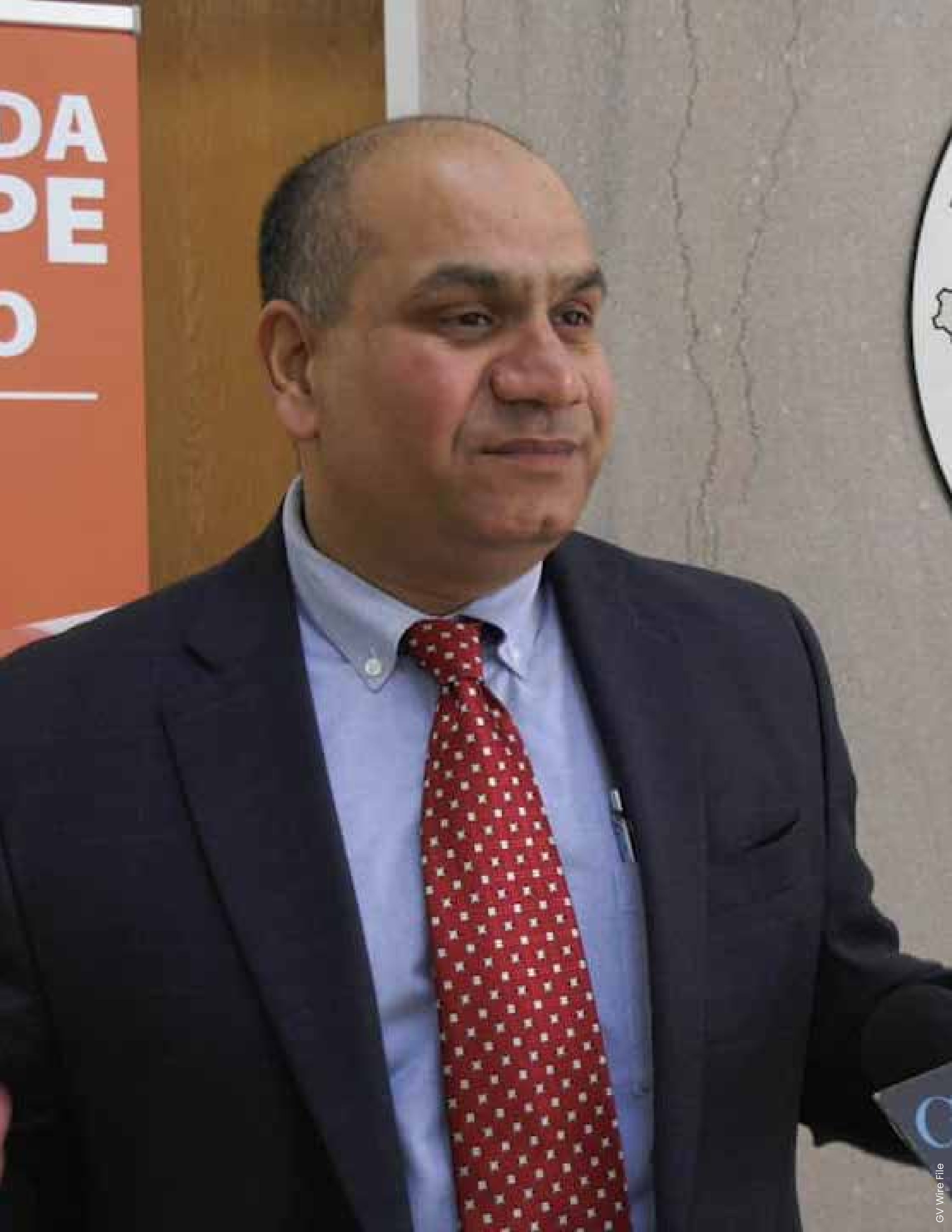
GV Wire File