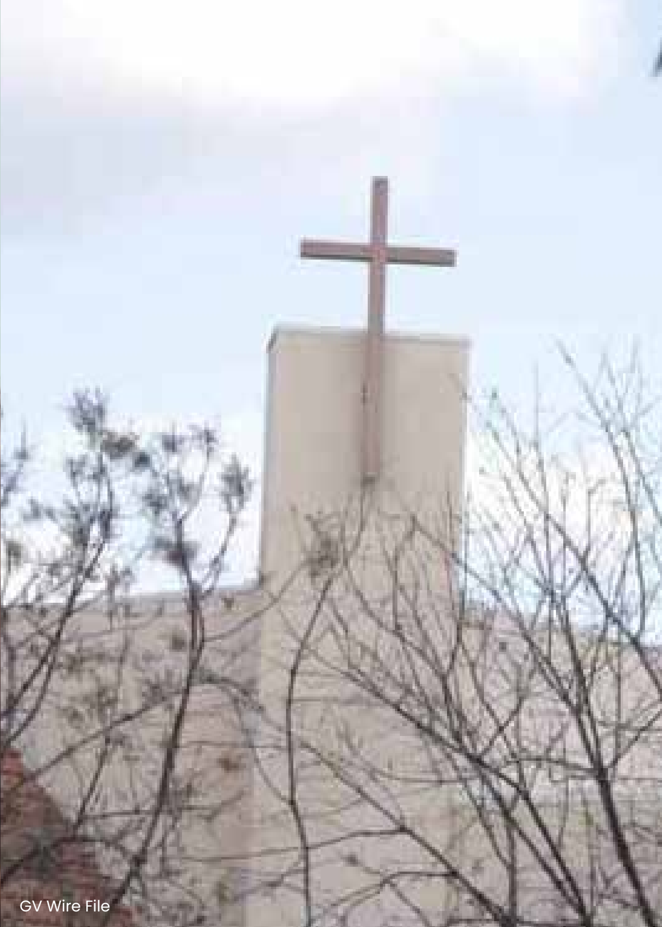
GV Wire File