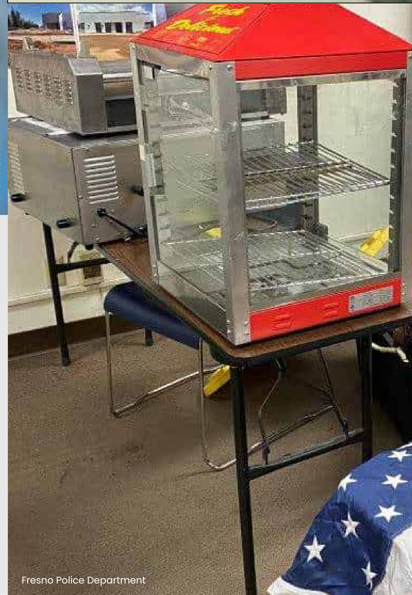
Fresno Police Department