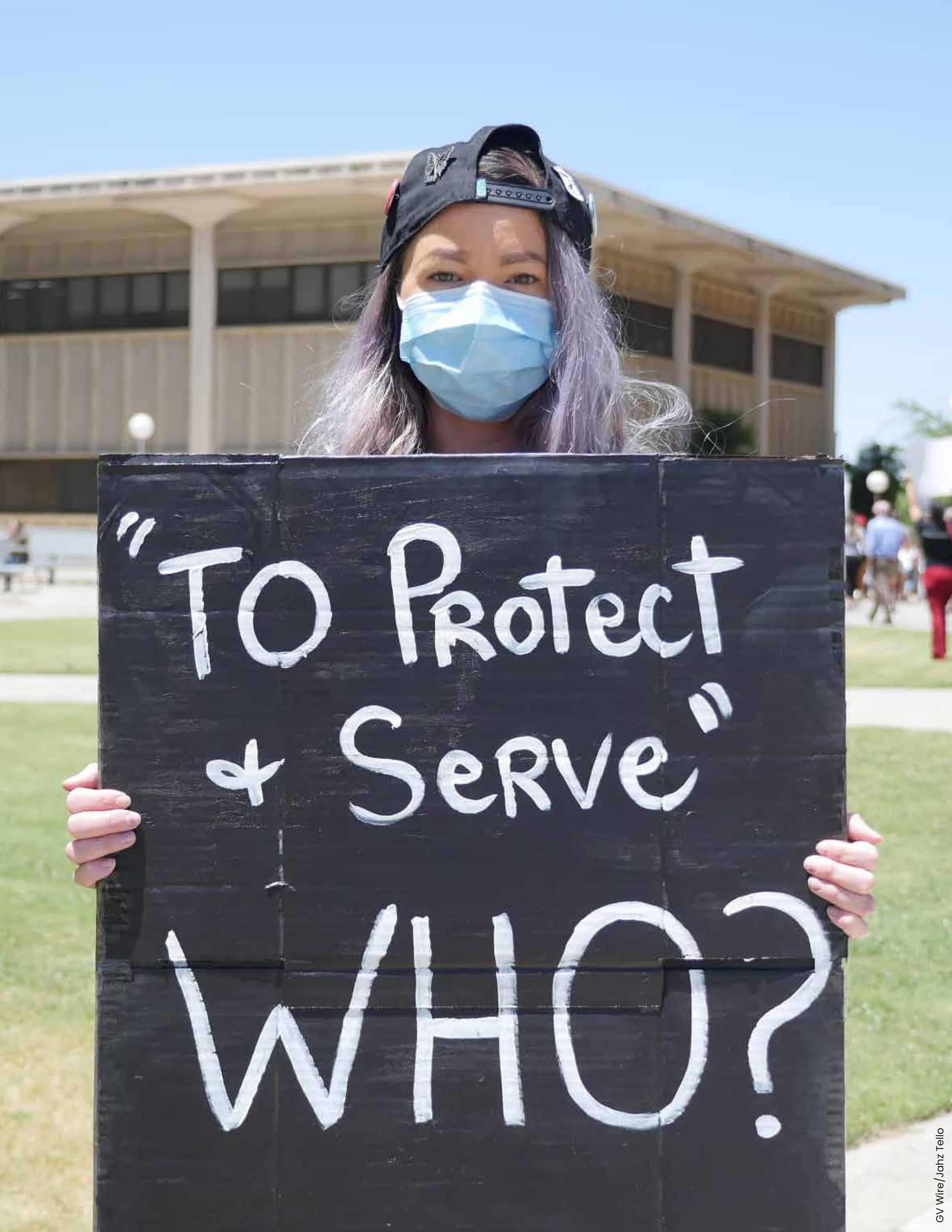
GV Wire/Jahz Tello