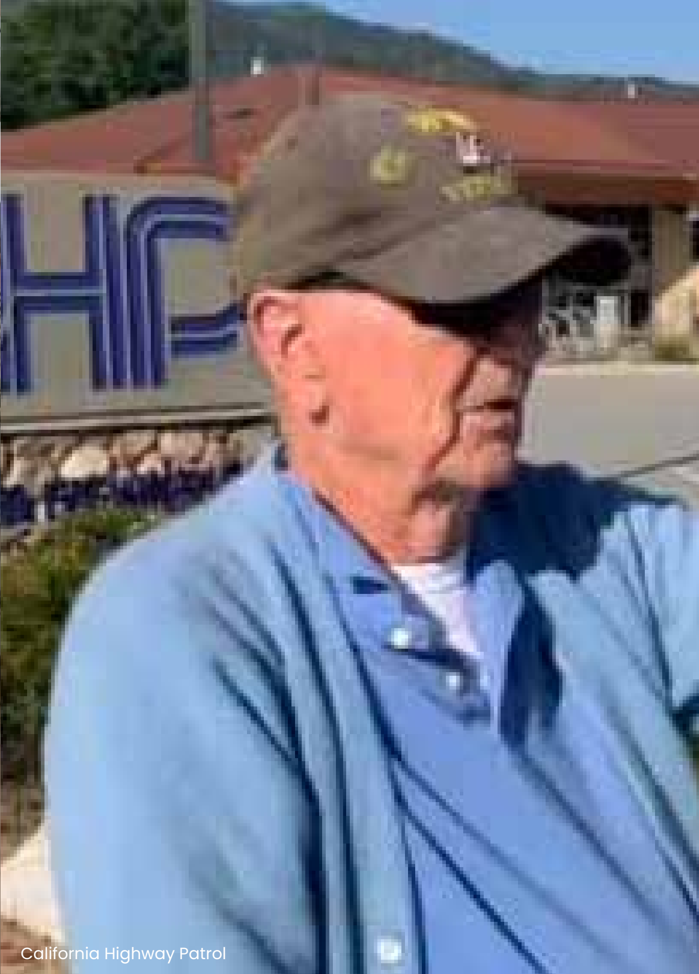
California Highway Patrol